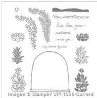
Live, Love, Grow Photopolymer Stamp