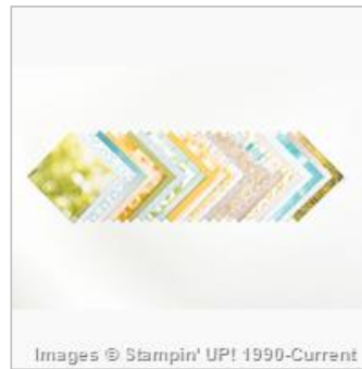
Serene Scenery Designer Series