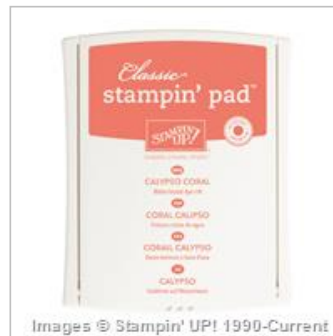
Calypso Coral Classic Stampin' Pad