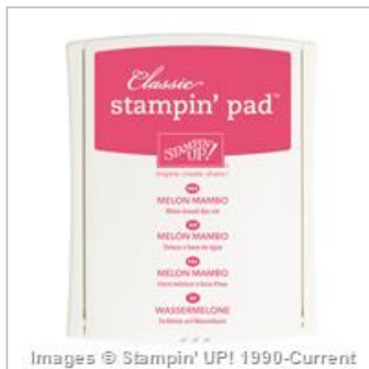
Melon Mambo Classic Stampin' Pad