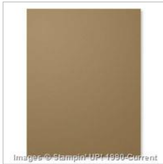
Soft Suede 8-1/2" X 11" Cardstock