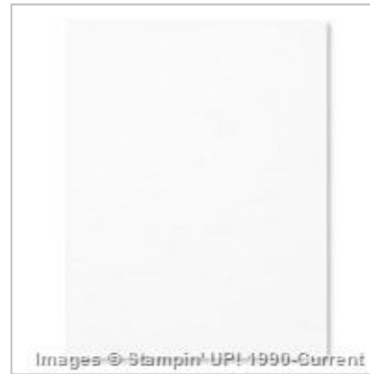
Whisper White 8-1/2" X 11" Cardstock