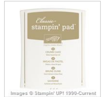
Crumb Cake Classic Stampin' Pad