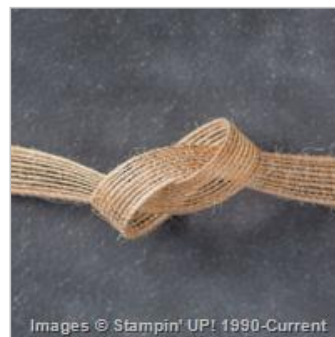
5/8\" (1.6 Cm) Burlap Ribbon