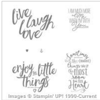
Layering Love Clear-Mount Stamp Set