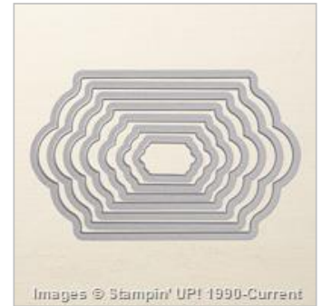
Lots of Labels Framelits Dies