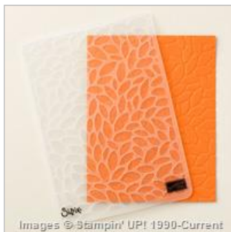
Petal Burst Textured Impressions Embossing Folder