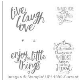
Layering Love Wood-Mount Stamp Set