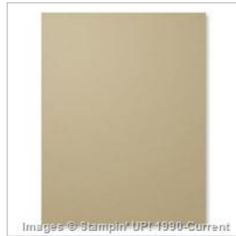
Crumb Cake 8-1/2" X 11" Cardstock