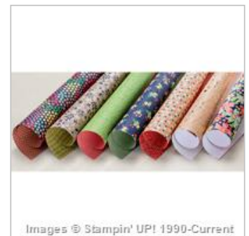
Affectionately Yours Specialty Designer Series Paper