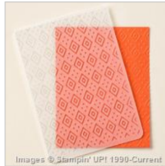
Boho Chic Textured Impressions Embossing Folder