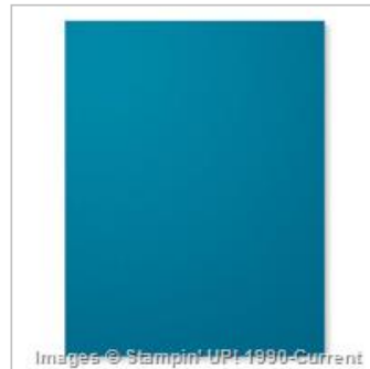
Dapper Denim 8-1/2" X 11" Cardstock