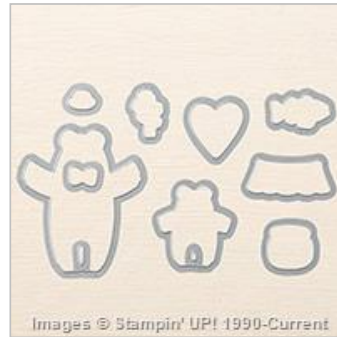
Bear Hugs Framelits Dies