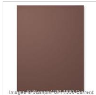
Chocolate Chip 8-1/2" X 11" Cardstock