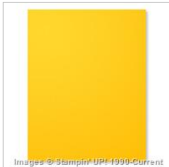
Crushed Curry 8-1/2" X 11" Cardstock