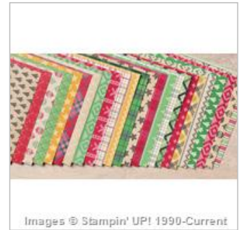
Warmth & Cheer Designer Series