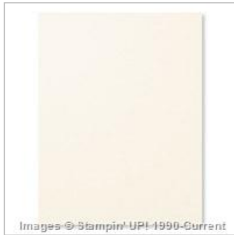
Very Vanilla 8-1/2" X 11" Cardstock