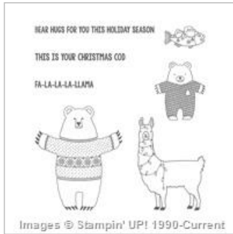
Fa-La-La-La Friends Photopolymer Stamp