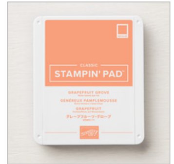
Grapefruit Grove Classic Stampin' Pad