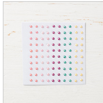
Share What You Love Artisan Pearls