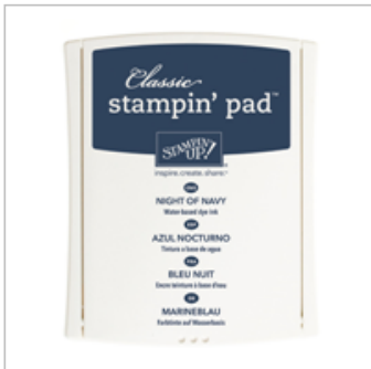
Night Of Navy Classic Stampin' Pad