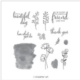
Love What You Do Photopolymer Stamp