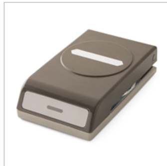
Classic Label Punch