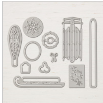
Alpine Sports Thinlits Dies