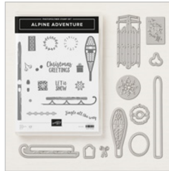
Alpine Adventure Photopolymer Bundle