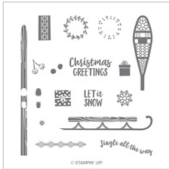
Alpine Adventure Photopolymer Stamp