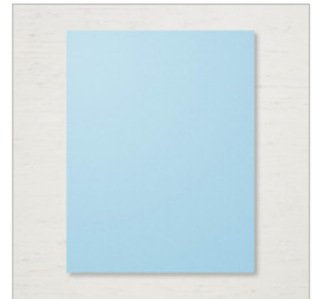
Balmy Blue 8-1/2" X