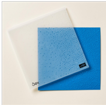
Softly Falling Textured Impressions Embossing Folder