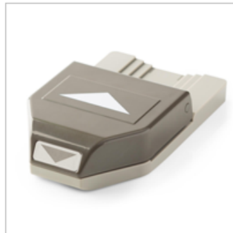
Banner Triple Punch