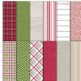
Festive Farmhouse 12" X 12" (30.5 X 30.5 Cm) Designer Series